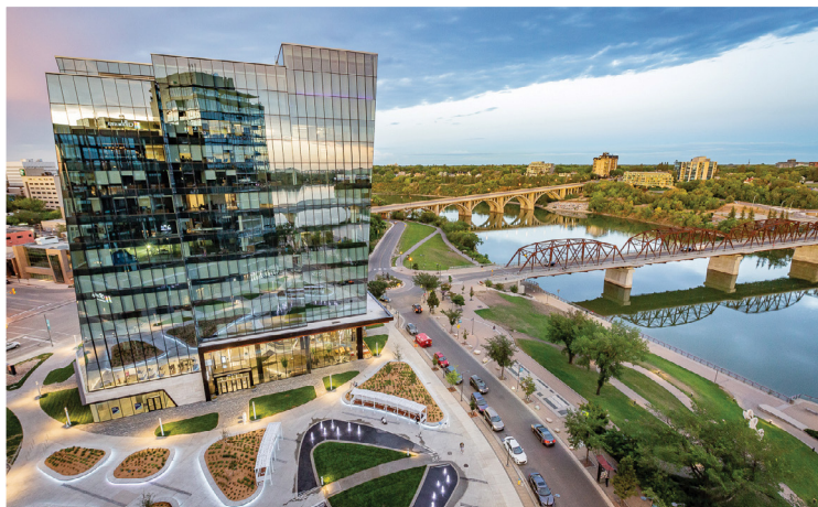
River Landing Development in Saskatoon.