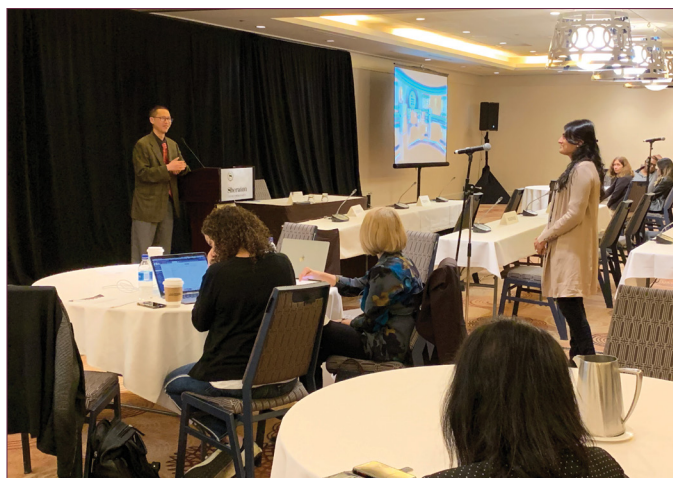
Hybrid ORA Annual Scientific Meeting, in Toronto, May 2022.