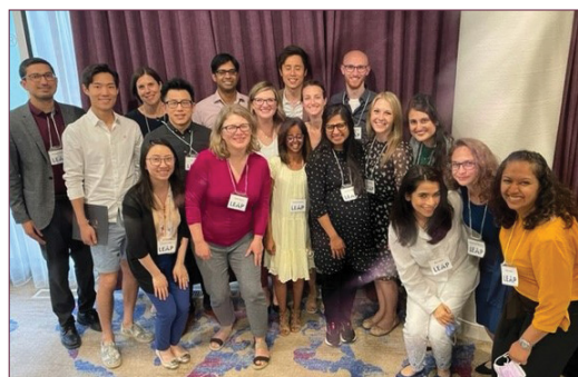
LEAP 2020-2022 cohort at their final meeting.

The Continuing Professional Development (CPD) subcommittee has renewed its commitment ( rheum.ca/education/aims-goals-and-mission-statement-of-the-cra-cpd-subcommittee/ ) to being a Royal College-Accredited CPD Provider ( www.royalcollege.ca/rcsite/cpd/royal-college-accredited-cpd-providers-e ) with the growth of training material for reviewers within the team and active accreditation of internal and external rheumatology activities, providing reassurance for members regarding the quality of continuing professional development materials. The subcommittee has also taken strides to ensure members are educated about the opportunities within the Royal College Maintenance of Certification Program ( www.royalcollege.ca/rcsite/cpd/maintenance-of-certification-program-e ). Over the last decade, there has been ongoing support for the Practice Reflection Award, just one of the projects aiming to help CRA members obtain valuable Section 3 credits.