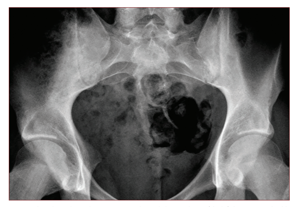
Figure A. The pelvic radiograph at presentation shows slight irregularity of the left iliac cortex and mild joint space narrowing on the right side. It does not show any definitive features of sacroiliitis.