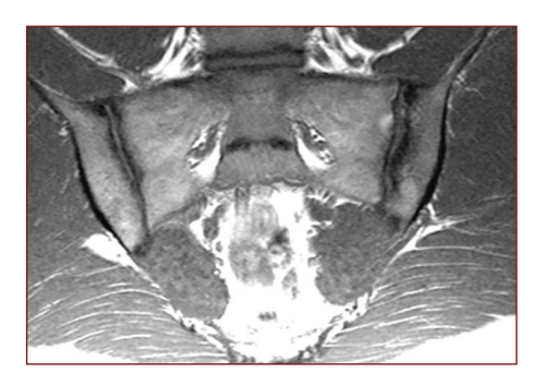
Figure D. 2-year follow up T1W-SE scan shows erosion of the left iliac cortex with joint space widening and fat metaplasia in the left lower iliac bone.