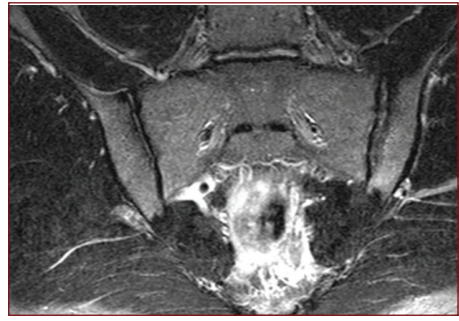
Figure E. 2-year follow up STIR scan shows some resolution of bone marrow edema though with residual increased signal on the scan.